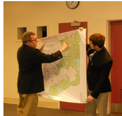
Senator Ebbin and his Aide show map of the areas of sex trafficking focus.