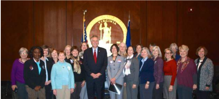
Delivering the human trafficking petition to Governor Terry McAuliffe during Lobby Day.

AAUW Washington Update, February 6, 2015