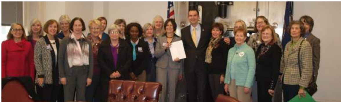
AAUW of Virginia members met with Lieutenant Governor Ralph Northam during State Lobby Day in Richmond on February 4, 2015, to deliver the human trafficking petition.