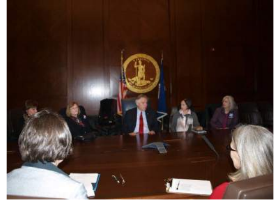
Discussing public policy with the Governor.