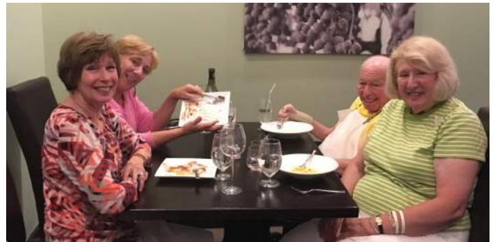
Members and guests at Restaurant Bastille on August 19