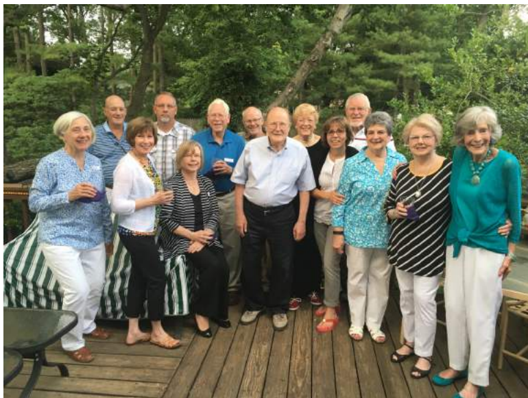
"Gamers" at June Game Night