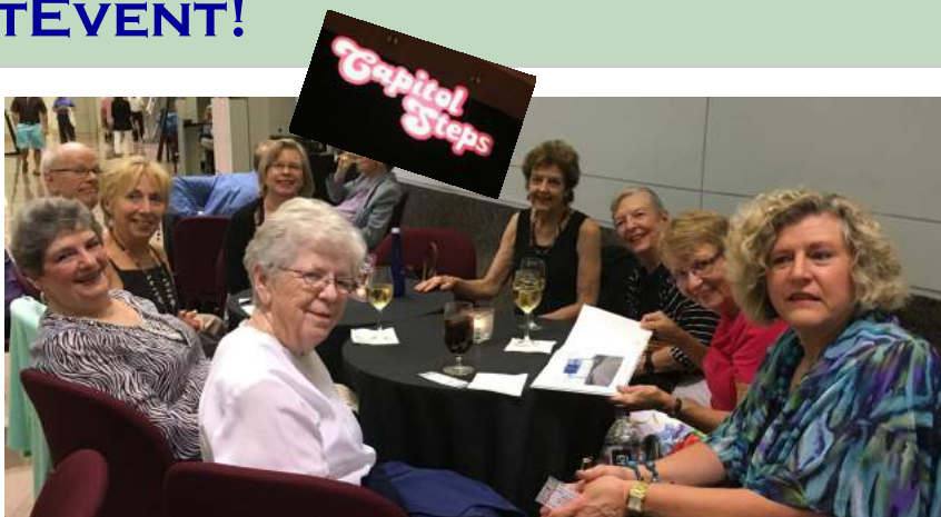
Members share an evening of laughter at Capitol Steps performance