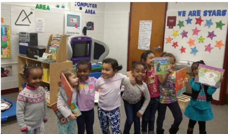
So excited to read the new books! Stop by for a visit!!!