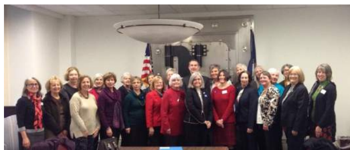
Lt. Gov. Ralph Northam with AAUW of VA delegation