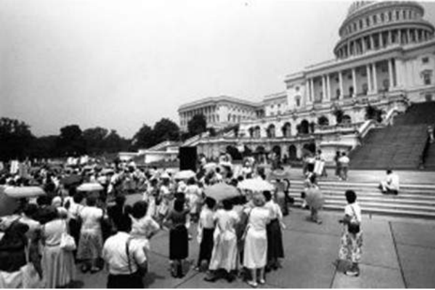
AAUW members gather before first ever Capitol Hill Day, June 27, 1989.