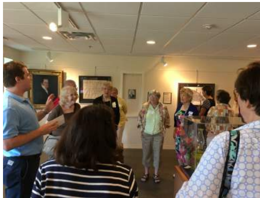
Attending a tour of the Salem Museum