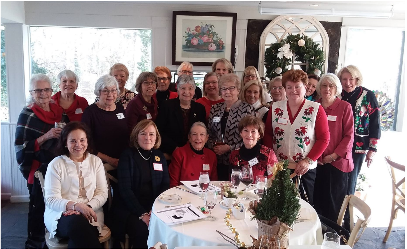
Joyful gathering at the Branch Holiday Luncheon on December 8