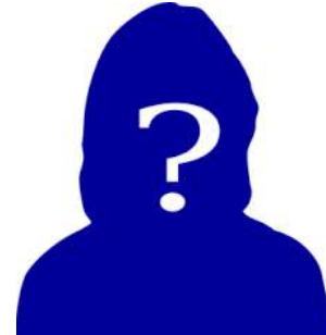
YOU AND ???

Nominations may also be made from the floor with the consent of the nominee.