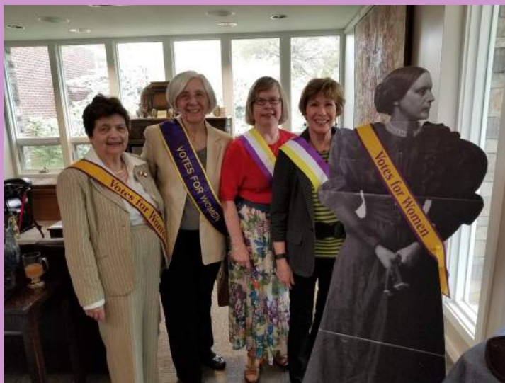
Four branch members attended the Turning Point Program at the Unitarian Church, April 14