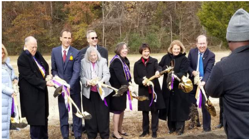
Groundbreaking of the Turning Point Suffragist Memorial, November 14, 2019

November 14, 2019: On a cold, but bright morning, folks gathered at Occoquan Regional Park in Lorton to celebrate the groundbreaking and celebration of the Turning Point Suffragist Memorial! There was excitement in the air as participants shed coats, enjoyed refreshments, and networked with other men and women who have been working towards the goal of a Suffragist Memorial for many years.