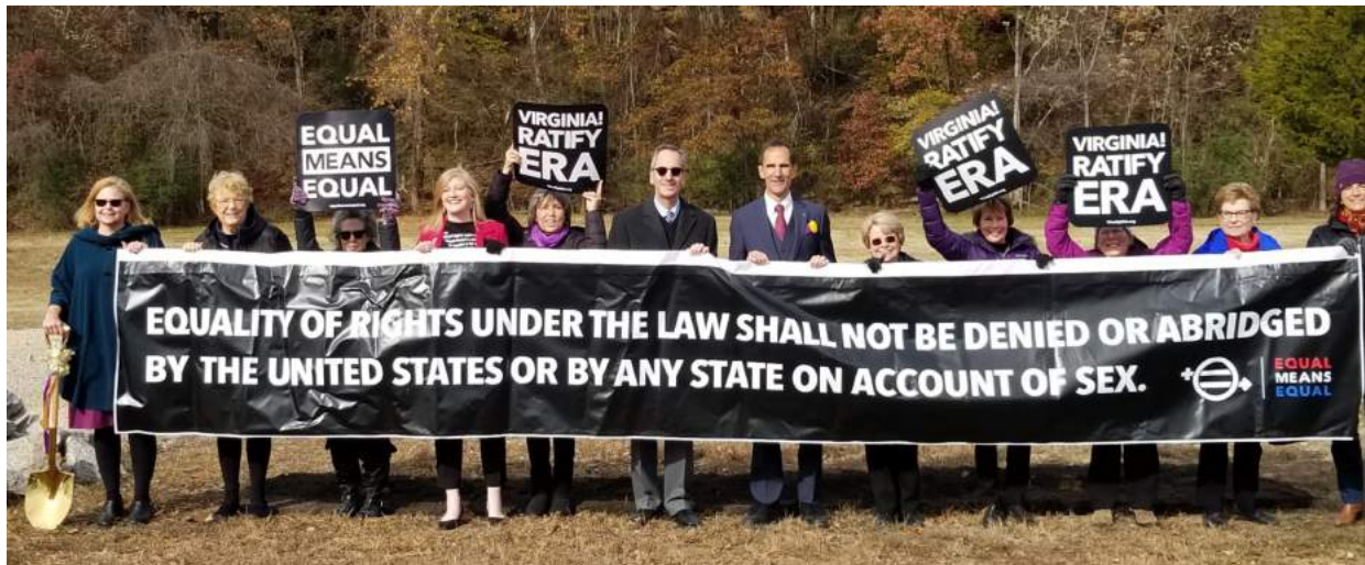
Several branch members happy to show their support—ERA YES!