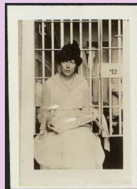
Lucy Burns in the Occoquan Workhouse. November 1917.

The museum is free and tours of the cell block are $5.00 for individuals 12 and over. Group tours and rates are available.