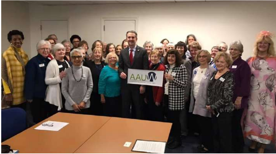
Virginia attendees on Lobby Day, January 15, 2020