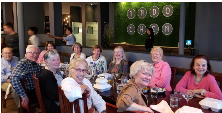
Dining out at Indo Chen in May

The Dining Out Group plans to meet up again in August for Alexandria Restaurant week! No dates have been published yet.