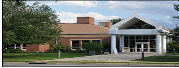
Sherwood Regional Library