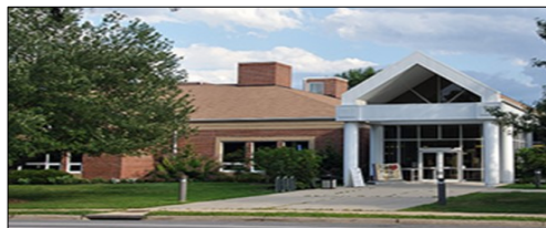
Sherwood Regional Library