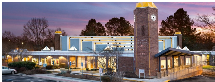
Pohick Regional Library